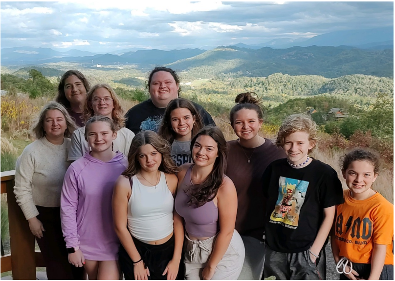
First Jeff Youth had a great fall retreat weekend in the Smokies.